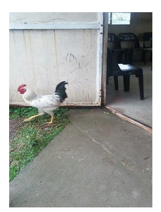
Realities of rural working!