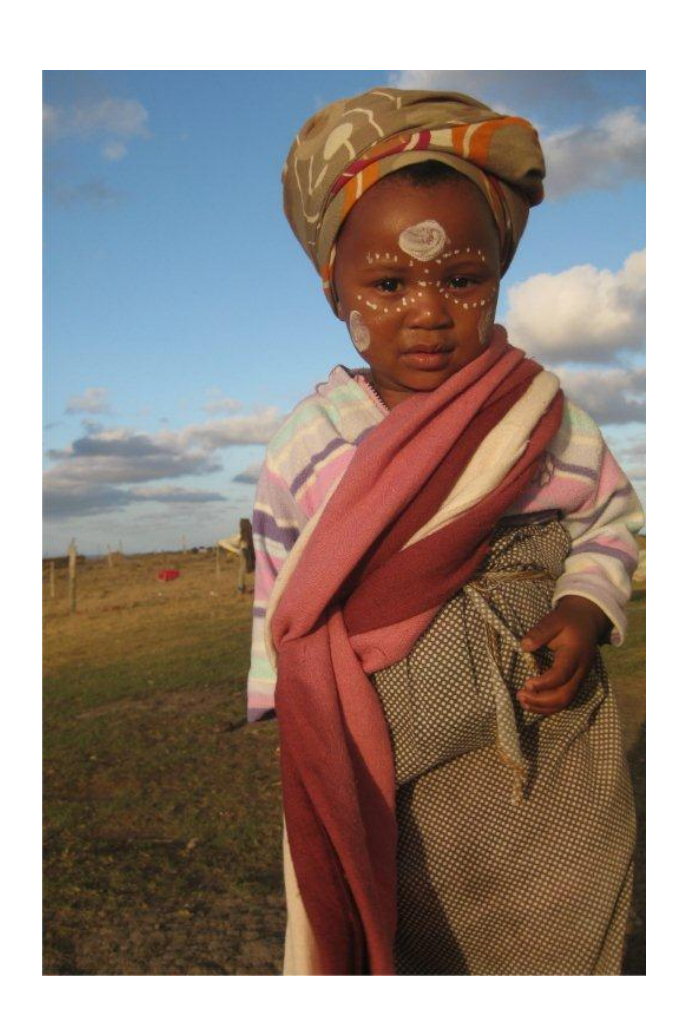
Jabulani Rural Health Foundation Annual Report 2009-10