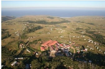
Zithulele village from the air

Jabulani is a non-profit organisation providing support to Zithulele Hospital and community, in a very rural part of the Wild Coast of South Africa.