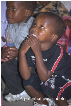
A potential pre-schooler