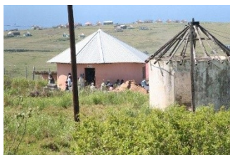
One of the huts before renovation...

Great progress has been made on the renovation of the Waiting Mother's Accommodation. All going well, pregnant ladies will be able to start using this facility by the end of March 2009. It will be a far safer place to await labour than a remote homestead!